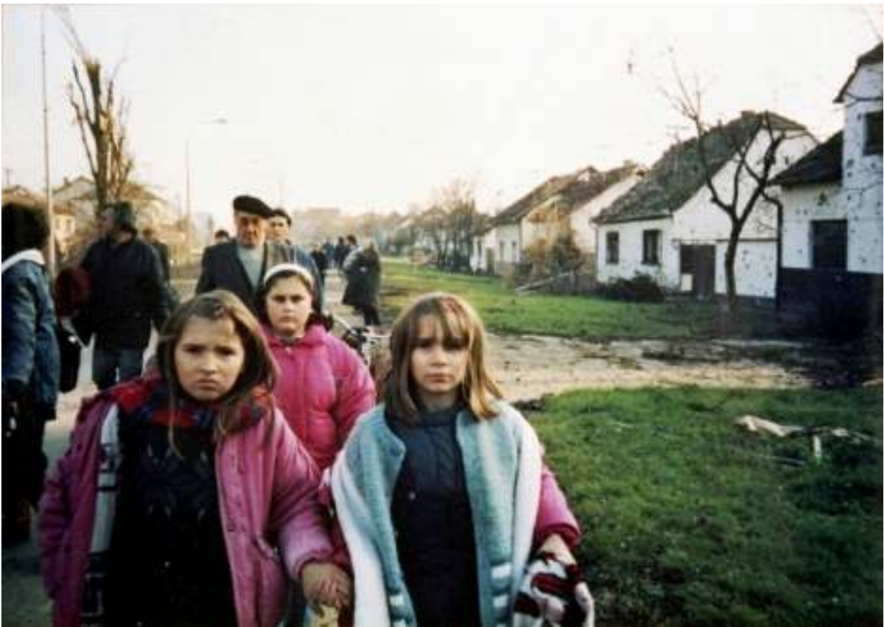
The column of refugees in Vukovar, 1991