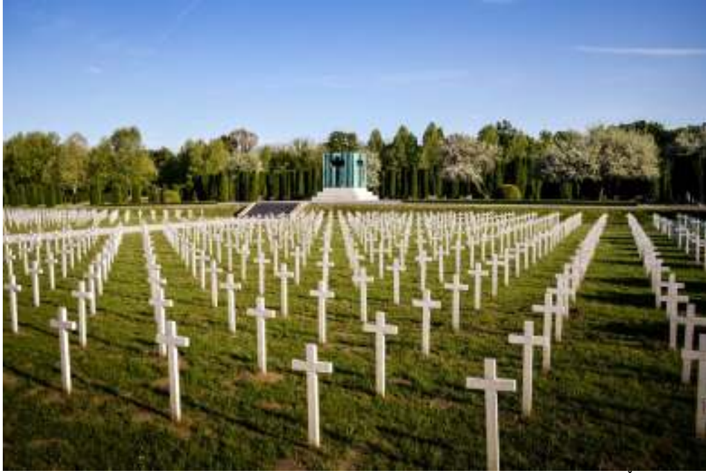
memorial Cemetery of the Victims of the Homeland War in Vukovar