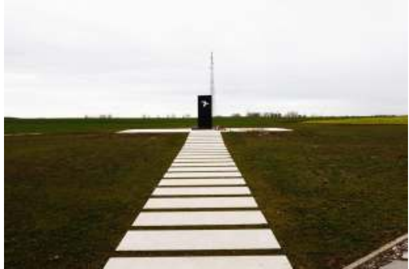
Memorials to mass graves of the Victims of the Homeland War