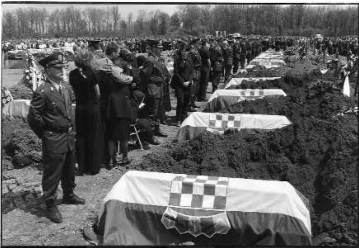
Joint burial of victims exhumed from mass grave at Nova Dubrava Cemetery in Vukovar, in spring 1998.