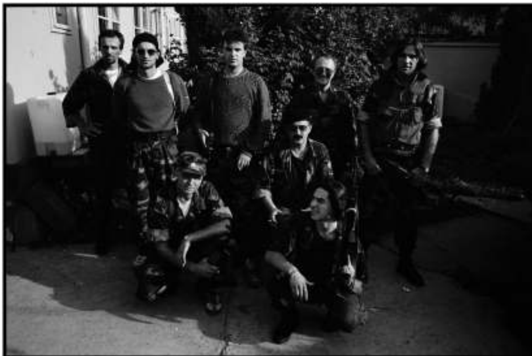
Group of Croatian veterans from Vukovar, Žabe bukače , photography: Zoran Filipović Zoro