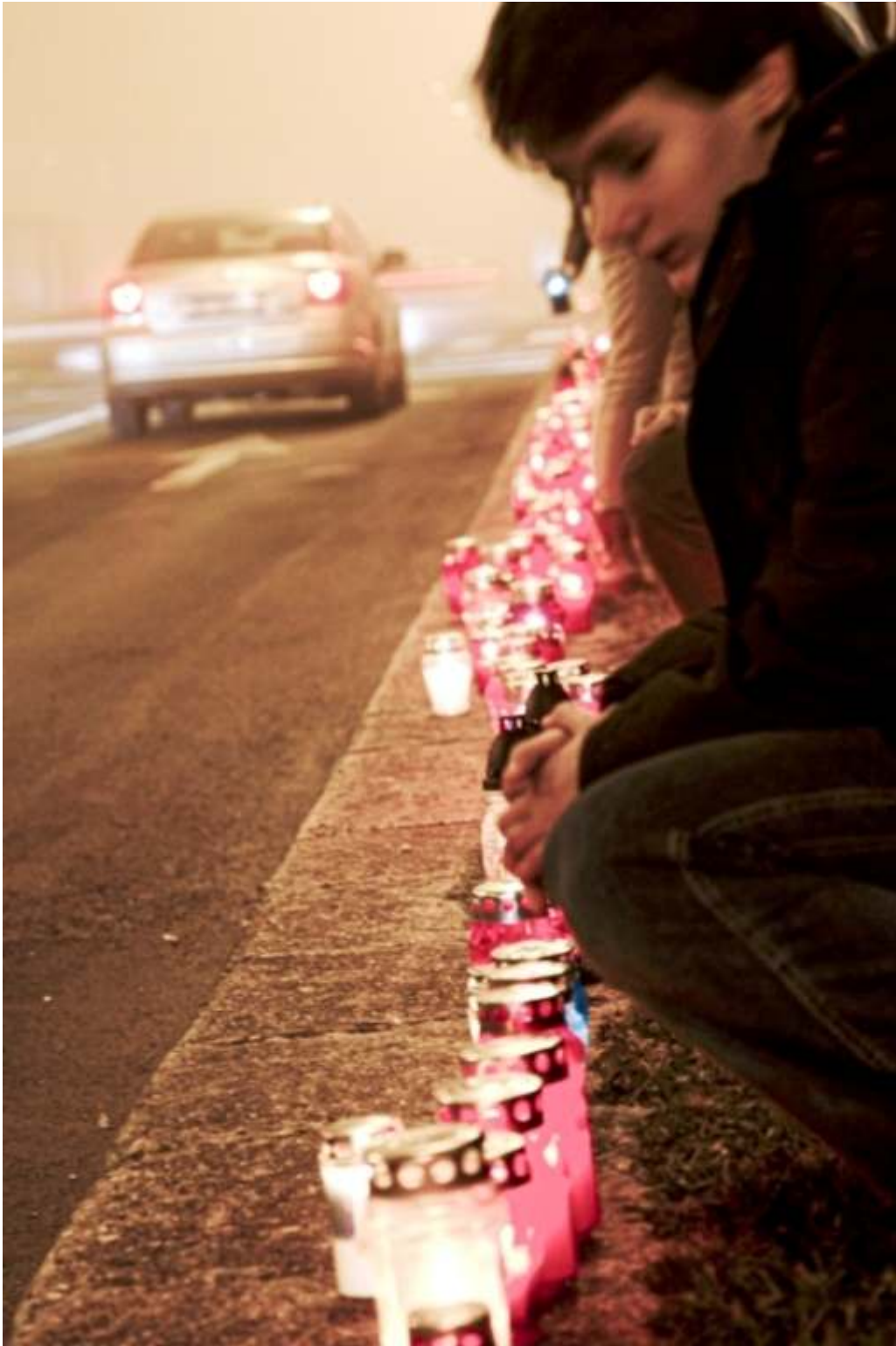
Lighting candles along the streets named after the city of Vukovar on the Memorial Day for the victims of the Homeland War