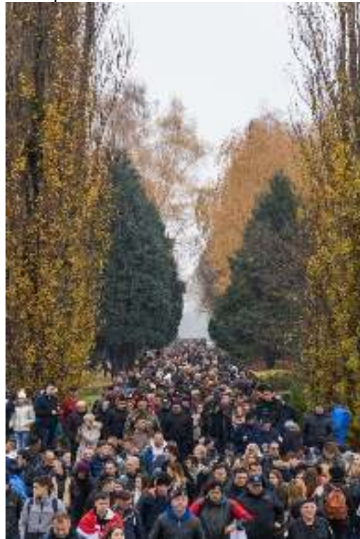
Memorial Day for the victims of the Homeland War, and Memorial Day for the victims of Vukovar and Škabrnja